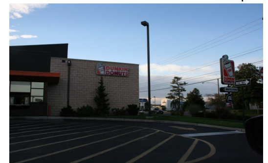
Dunkin Donuts is a coffee shop