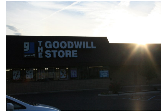
GoodWill is a used clothing store