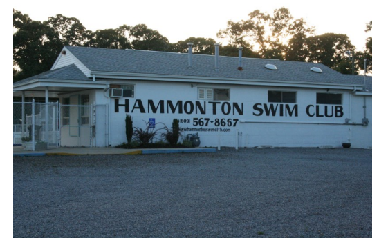
Hammonton Swim Club is the local pool