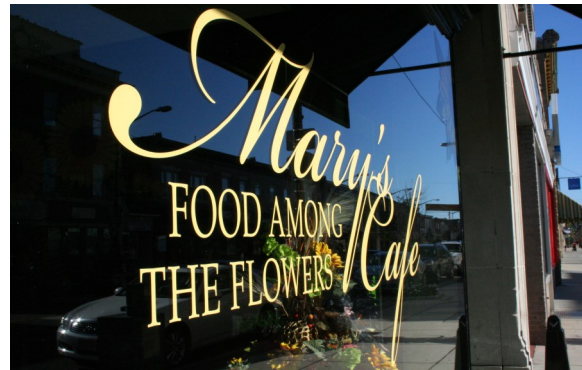
Mary's is a breakfast and lunch Café