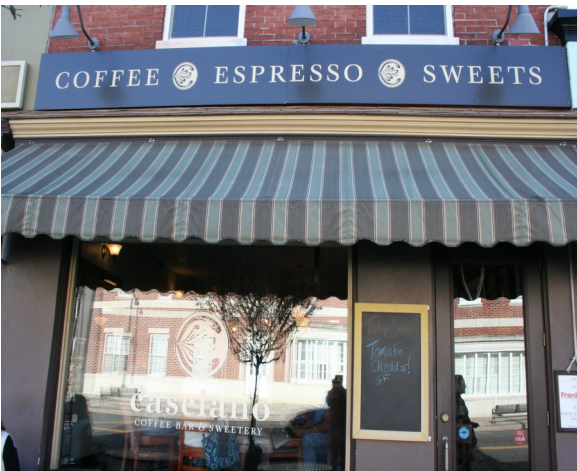
Casciano's is a coffee and pastry place.