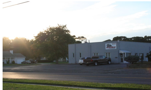
Jersey Devil CrossFit is a local gym