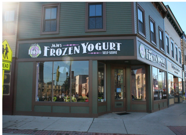
JoJo's FroYo is a frozen yogurt shop