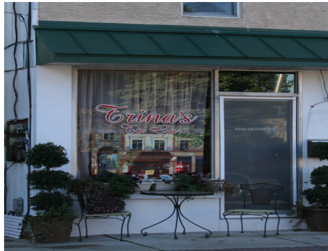
Trina's Café is a very popular eatery in the center of town for lunch and dinner.