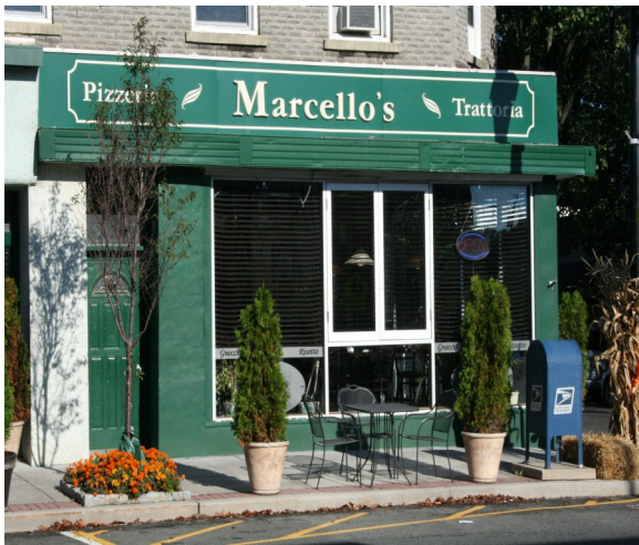
Marcello's is an Italian Restaurant