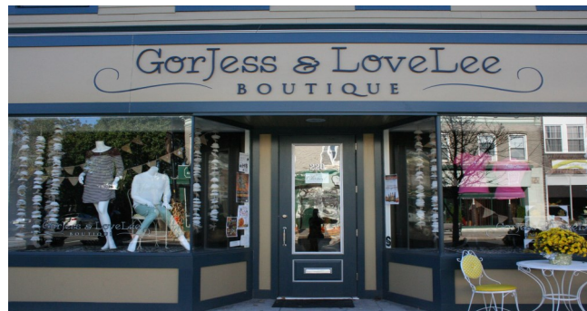
GorJess and LoveLee is a new boutique