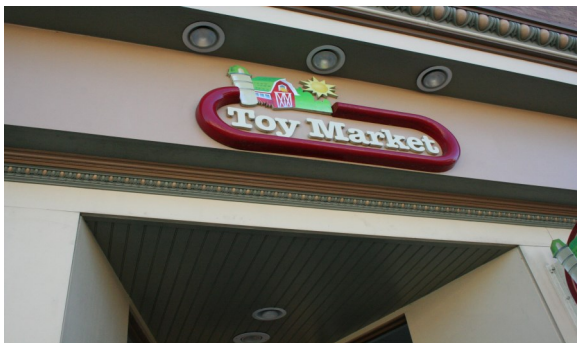
This is the local Toy Market for kids.