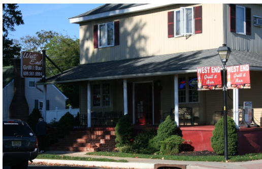
West End is a Bar & Grill in town