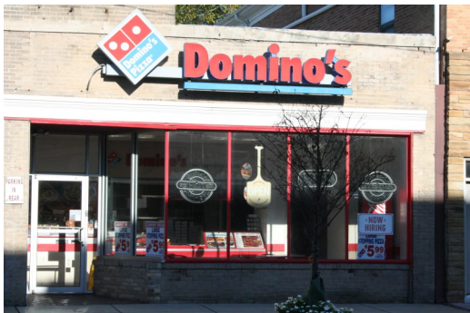
Domino's is a local pizza place