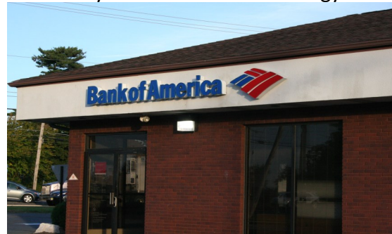
Bank of America is a popular bank